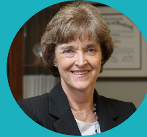
Judy Monroe CDC Foundation